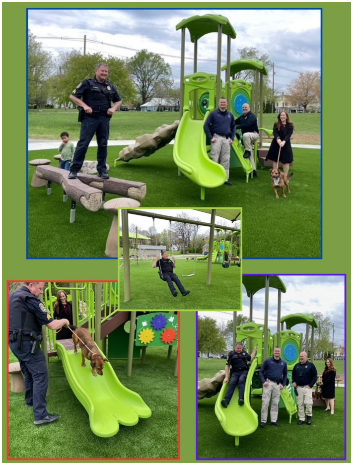
Pictured: Middletown Police Department and Middletown City Clerk